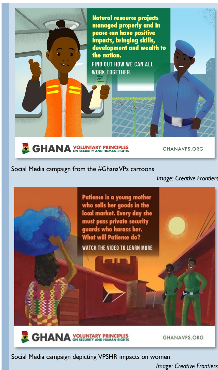
Social Media campaign from the #GhanaVPs cartoons

13 Through our experience in chairing the Ghana ICWG, and building upon our experience in previously having led the Indonesia ICWG several years ago, FFP has begun to recognize key lessons and good practices that can be relevant and informative to VPSHR in-country processes writ large. Pursuant to this recognition, in 2018 FFP partnered with DCAF Geneva and ICRC — both observers to the VPI — to conduct a study into lessons learned from VPSHR national level processes in Colombia, D.R. Congo, Ghana, Indonesia, Nigeria, and Peru. The findings of this study will hopefully provide a useful resource for future in-country processes, such as the Myanmar ICWG, which remains at an early stage of development. Separately, FFP continues to encourage the implementation of the VPSHR by companies in sectors other than oil, gas, and mining, as FFP has witnessed first-hand the effective use of the VPSHR in sectors as diverse as agribusiness, renewable energy, construction, and transportation. As implementation of the VPSHR increases, FFP believes it is critical that other sectors be afforded support in implementing the VPSHR effectively as possible.