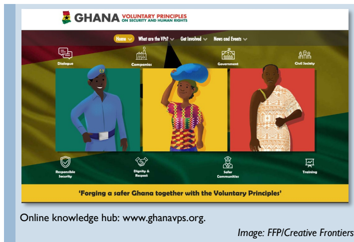
Online knowledge hub: www.ghanavps.org .

6 Through our work in Ghana, FFP has engaged directly with local communities and civil society organizations throughout the country. Since 2015, FFP has trained and educated local community groups in the Ashanti, Brong-Ahafo, Volta, Upper East,