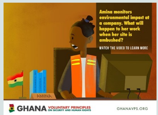
Media campaign to launch the #GhanaVPS series: clockwise from the top left; Samuel Asamoah from CSO Youth Bridge distributing bumper stickers; Youth Bridge educating schools and youth about the VPSHR using the cartoon; snapshots from the social media campaign for #GhanaVPS; bumper sticker.